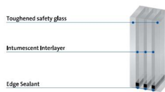
EI 60 fire rated glass