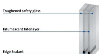
EI 30 fire rated glass

Range of application: internal and external.